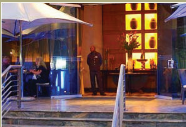
InterContinental Johannesburg O.R. Tambo Int'l Airport