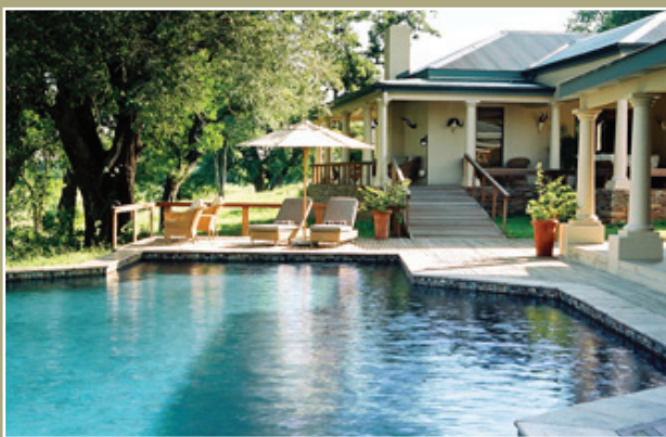
Rattray's Camp—one of several camps at MalaMala