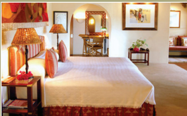
Room at MalaMala Main Camp